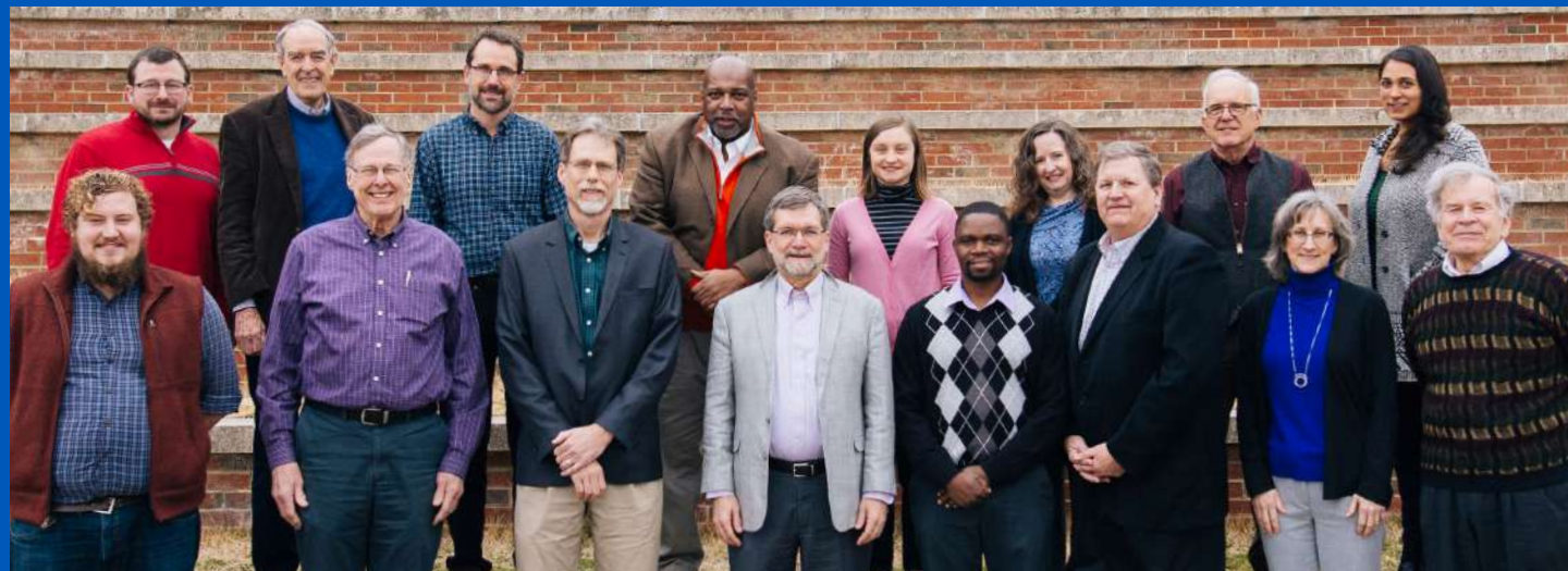
CSCS Board of Reference, Oversight Board, and staff