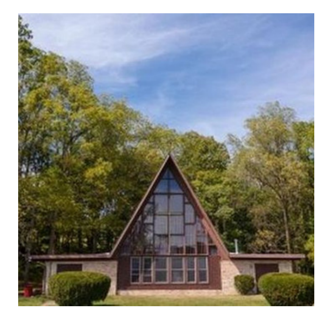
Camp Friedenswald, where the first CSCS pastoral retreat will be held in partnership with Mennonite Creation Care Network.

Who cares about climate change? Pastoral retreat Hidden Acres Mennonite Camp and Retreat, ON